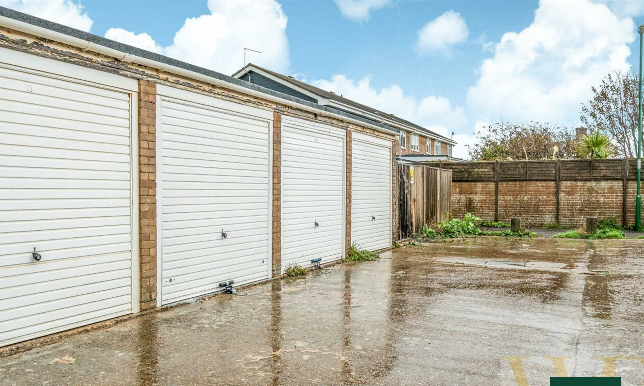
Garage, 10 The Moorings | | Shoreham-By-Sea | BN43 5JB